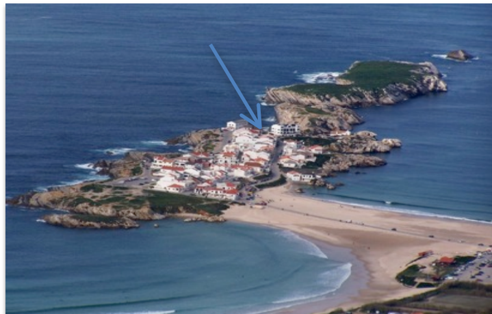
aprox. localization of the house

Raul Brandão , a very known Portuguese writer says about Baleal in one of his books “... Baleal , the most beautiful beach of the Portuguese land”