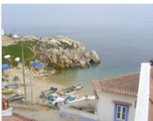
view from the roof terrace, over the beach

Your breakfast may be private, and taken in the bedroom terrace, or if you wish, with us, in family. The entire 1º floor will be free, for your complete privacy.