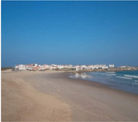
the island seen from the beach